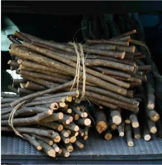
Step 1 We started by collecting the branches, each one cut to size and then bundled for organized assembly.

Before we started to make the lanterns, we sketched out our concept. We then made a prototype to work out any glitches. From the prototype, we were able to make a list of materials and work out the logistics of making multiple lanterns.