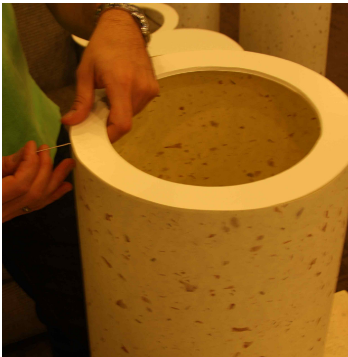
Step 3 To create the paper lanterns we first cut foam core circles (top and bottom), then attached the paper onto the circles with "T" pins.